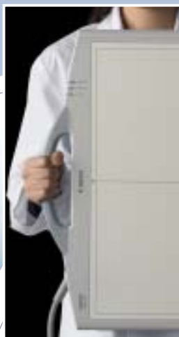
Easy-carry ergonomic design, weighs just 10.6 lb. (4.8 kg).

Less than an inch thick (23 mm) and weighing only 10.6 lb. (4.8 kg), the compact CXDI-50C can be flexibly used in diverse applications, including trauma, ICU, and bedside exams. It's portable, lightweight, and easy to position—even the patient can comfortably hold the unit in place during image capture, if necessary.