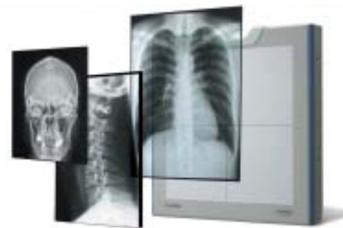
Automatic sizing of X-ray images up to 17 x 17 in. (43 x 43 cm).

Thanks to a large imaging area of 17 x 17 in. (43 x 43 cm), the CXDI-40EG lets you capture desired anatomical views for both large and small format X-rays in portrait or landscape orientation—without having to rotate the detector unit. From examinations of the skull, spine, chest, abdomen, to the extremities, the generous size of the detector accommodates a wide variety of exams.